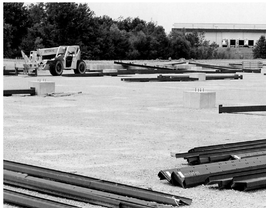
New Spec Building